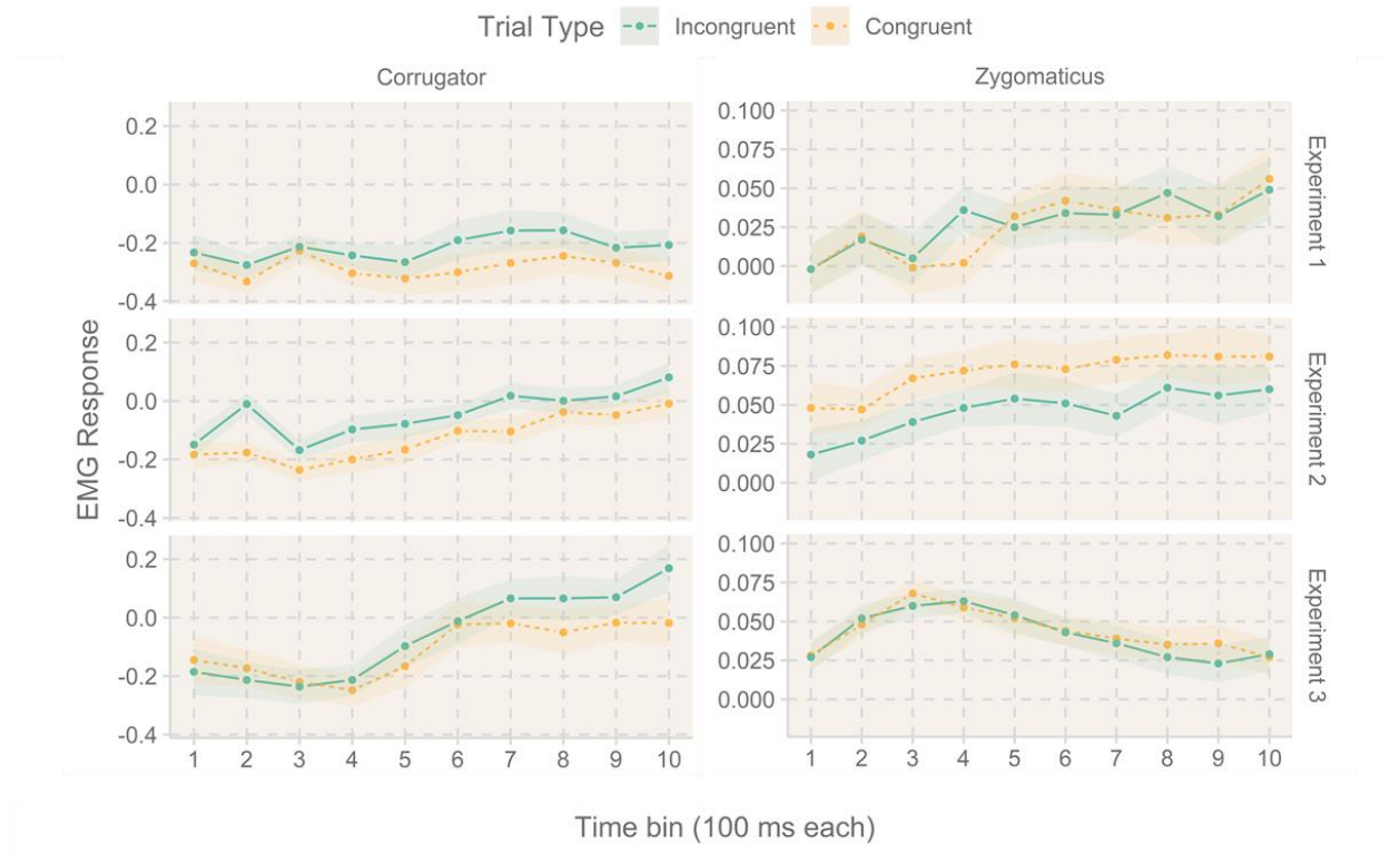
Figure S1. Grand averages of unstandardized EMG activation (RMS) in mV of the corrugator and zygomaticus muscles as a function of each time bin and congruency in the three experiments. Shaded areas represent within-subject standard errors.